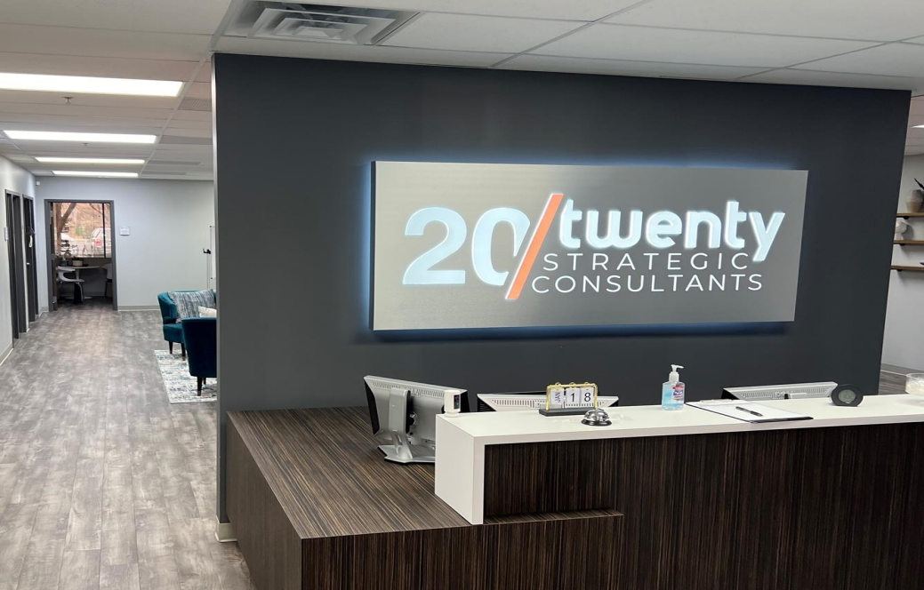
Ste 100 - Entrance