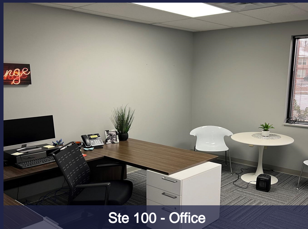
Ste 100 - Office