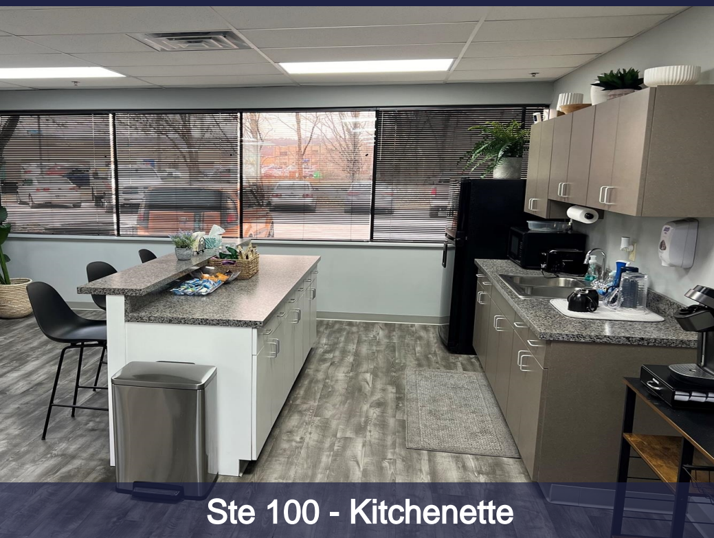
Ste 100 - Kitchenette