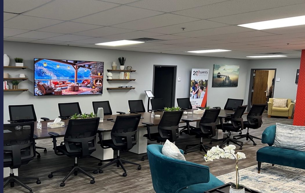
Ste 100 - Conference Room